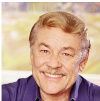
DR JERRY BUSS

THE FOLLOWING ARE THE 2019 INDUCTEES, WE WILL ANNOUNCE THE CLASS OF 2026 INDUCTEES SOON, TO YOUR EMAIL INBOXES BEFORE PRESS